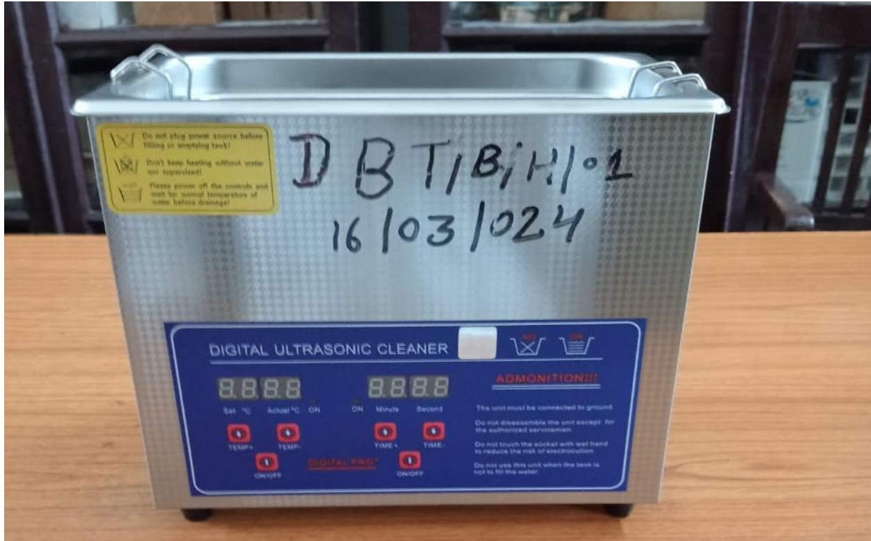
Digital Ultrasonic Cleaner

Ultrasonic cleaners use high frequency wave to create cavitation bubbles in the cleaning liquids. When the ultrasonic cavitation bubbles collapse, they create a cleaning action that can remove debris, dirt, grease, and other deposits from surfaces. The instrument is used to facilitate or enhance the removal of foreign contaminants from surfaces submerged in an ultrasonically activated liquid.